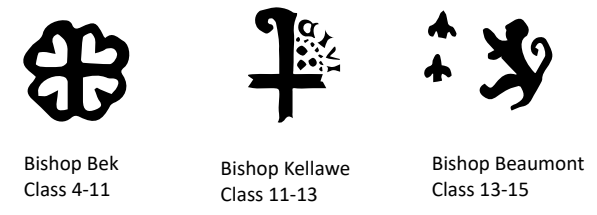
Bishop Bek Class 4-11 Bishop Kellawe Class 11-13 Bishop Beaumont Class 13-15

N.B. Berwick pennies have a different system