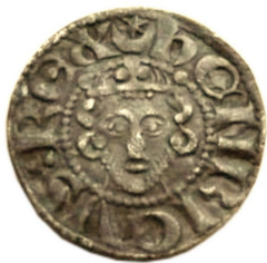
Class 1 North 983-4