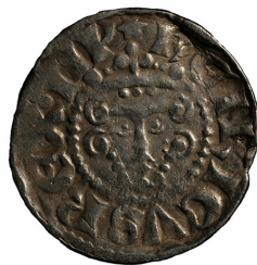
Class 3 North 986-8