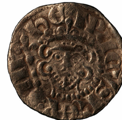
Class 5 North 991-9