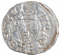
Class 2 North 985