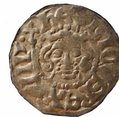
Class 6 North 1001