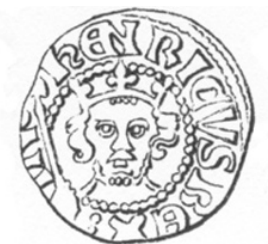
Class 7 North 1002