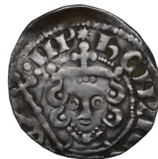
Class 4 North 989-90